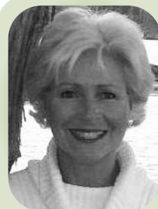
SENATOR PAULA BENOIT