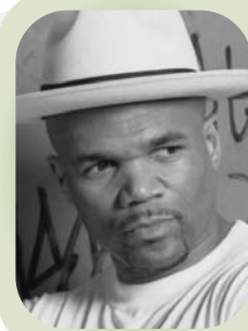
DARRYL "DMC" McDANIELS