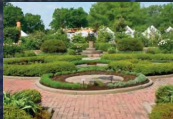
Cleveland Botanical Garden • Positively Cleveland