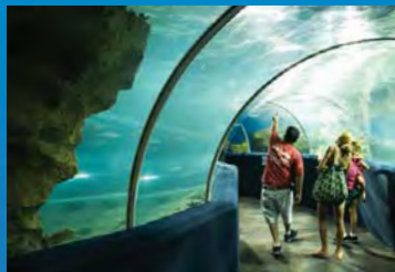
Greater Cleveland Aquarium • Dale MacDonald