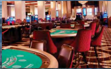
Horseshoe Casino Cleveland